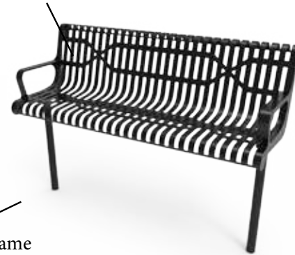
Inground Bench Frame