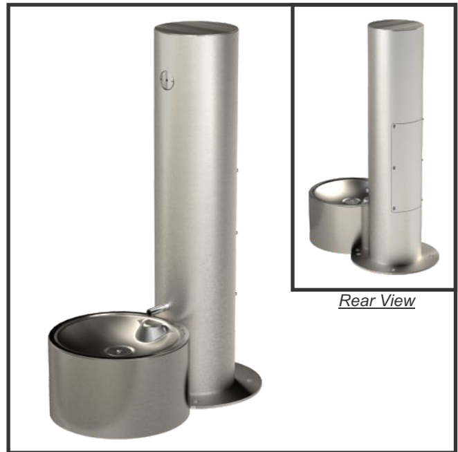
Model M-PM34 Shown

Unit shall be constructed of 14 gage type 304 stainless steel polished to a satin finish with 18 gage pet fountain bowl. Bottom plate shall be 3/16" thick and include three mounting holes with two additional mounting holes for pet fountain. 1/2" expansion anchor bolts shall be furnished. All other exposed fasteners shall be vandal resistant stainless steel screws.