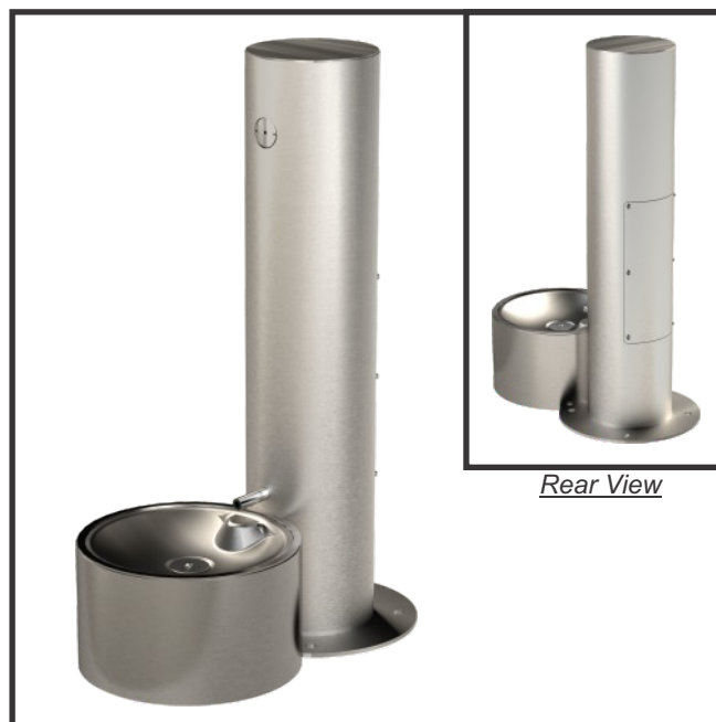
Model M-PM34 Shown

Unit shall be constructed of 14 gage type 304 stainless steel polished to a satin finish with 18 gage pet fountain bowl. Bottom plate shall be 3/16" thick and include three mounting holes with two additional mounting holes for pet fountain. 1/2" expansion anchor bolts shall be furnished. All other exposed fasteners shall be vandal resistant stainless steel screws.