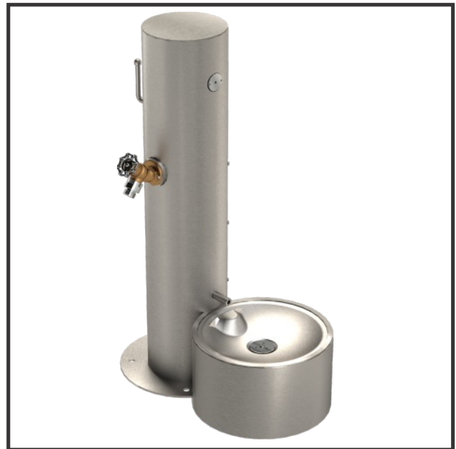
Model M-PM14 Shown

Unit shall be constructed of 14 gage type 304 stainless steel polished to a satin finish with 18 gage pet fountain bowl. Bottom plate shall be 3/16" thick and include three mounting holes with two additional mounting holes for pet fountain. 1/2" expansion anchor bolts shall be furnished. All other exposed fasteners shall be vandal resistant stainless steel screws.