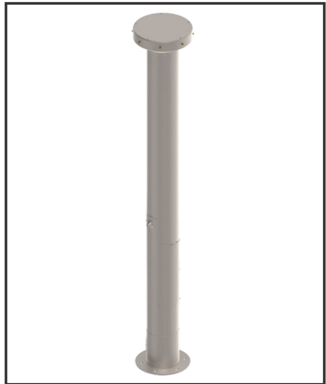
Standard Model: M-PCMST84

Custom color finishes available upon request